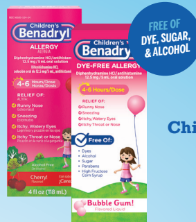
Children's BENADRYL® Allergy Liquid†‡