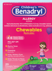
Children's BENADRYL® Chewables†